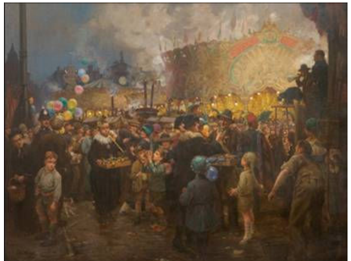
The Goose Fair, Nottingham Arthur Spooner Nottingham Castle Museum