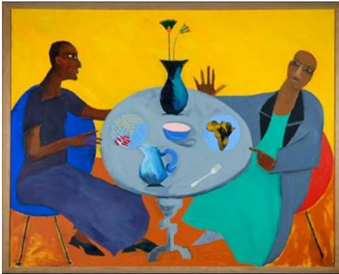
Five Lubaina Himid Leeds Art Gallery

A remarkable level of excitement about the use of paintings to support innovative teaching was evident from the nearly all of the participants. Some fundamentally important educational aspirations were being addressed as part of the work. In particular, cross-curricular teaching was being used in ways that acknowledged the limitations of tangential topic links, and hence was building on developments in educational practice over a twenty year period. Perhaps even more important than this was the evidence that pedagogical risk-taking was positively changing the ideas not only of the trainees themselves but also of experienced teachers that the trainees were working with.