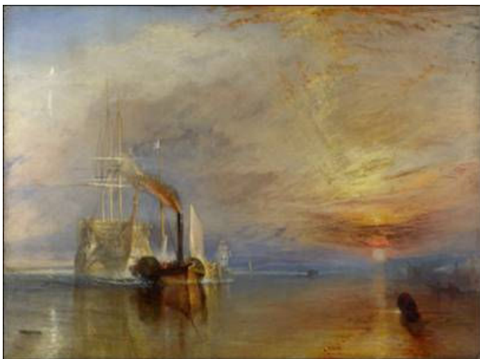
The Fighting Temeraire J.M.W. Turner The National Gallery

The sense of risk felt by the participants illustrates the extent of the departure taken from their 'normal' teaching. The reported effects suggest that this change of approach had a positive impact.