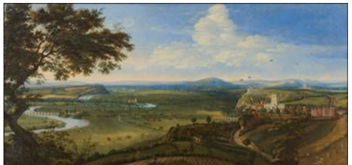
Nottingham from the East Jan Seberechts Nottingham Castle Museum

Whilst the lack of museum/gallery visit means that the overall experience would be to some extent compromised for pupils and their teachers, this confidence that a Take One Picture approach can still work in such a situation indicates both this student’s determination to use the ideas and also the remote availability of museum and gallery resources facilitated by the Partnerships.