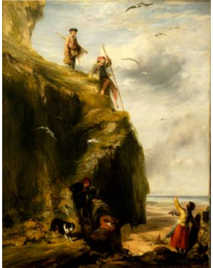
Returning from the Haunts of the Seafowl William Collins The Walker Gallery

Ultimately, the degree to which the initial premise of the Cultural Placement Partnership has evolved and moulded to the different needs of the different regional partnerships can be seen as an indication of its sustainability.