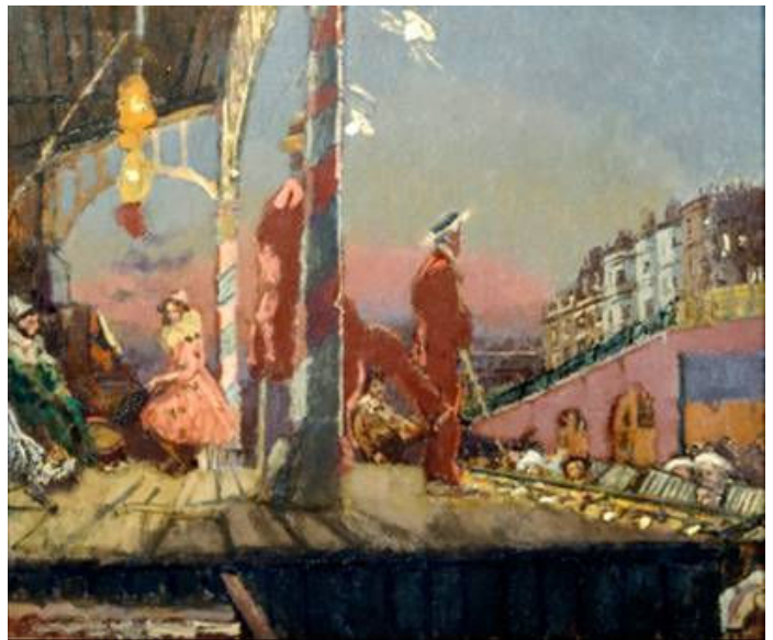
Brighton Pierrots W.R. Sickert The Ashmolean Museum

Whilst students and teachers focused heavily on the cross-curricular aspect of the Cultural Placement Partnership, participants indicated that they did so with learning objectives in mind.