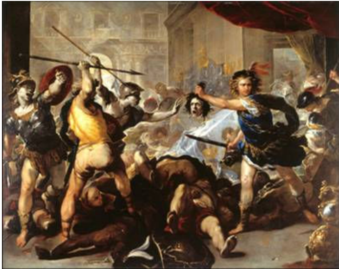
Perseus turning Phineas to stone Luca Giordano The National Gallery

manifest in the short term, but that they have endured beyond the duration of the students' courses.