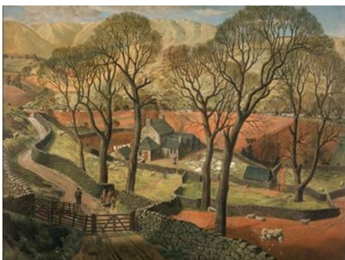
Springtime in Eskdale James McIntosh Patrick The Walker Gallery

Whilst students did not take part in the National Gallery's full Take One Picture scheme, Take One Picture was the phrase commonly used by participants in reference to the approach to which students were introduced and which they employed during their Cultural Placements.