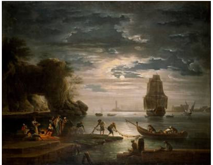
Coastal Scene (La Nuit) C.J. Vernet The Ashmolean Museum

Whilst this does not make for comparable experiences for the trainees, it provides both fertile ground for partnerships to mature and develop and takes steps towards establishing new partnerships.