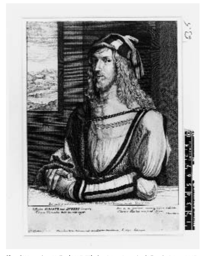
Plate 8 Wenceslaus Hollar (1607-77) after Dürer, Portrait of Albrecht Dürer, 1645. Etching. British Museum