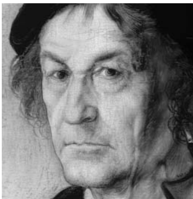
Plate 5 Infrared reflectogram of head and shoulders of NG 1938

There are other differences which can be discerned in the manner in which the National Gallery picture is painted, in comparison to other paintings indubitably by Dürer himself. The X-radiograph (Pl. 3)that shows the cracking so clearly also shows up a method of the application of paint which clearly differs from works such as the Prado self-portrait of 1498 or the portrait of Oswald Krel of 1499, both works which should be close in date and are superficially similar in format. They both