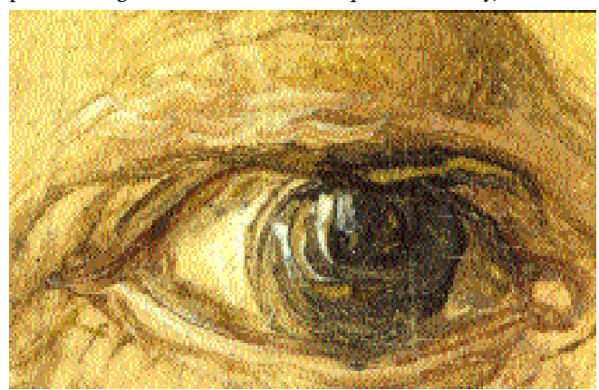
Plate 6. Detail of left eye of NG 1938

The painting of the face of the National Gallery portrait is thin and the modelling is carried out by means of many small hatching strokes. The irises of the eyes in particular are painted with thick brown strokes in a concentric fashion which gives little sense of the radial construction of the iris, or of the eyeball itself ( Pl. 6 ). There is no sense of the thickness of the inner eyelids, and the construction of the flesh around the eyeball is drawn in minimal fashion. Levey referred to 'the scratchy technique of the eyes'. This seems to describe the way in which paint is pushed around by the brush acting more like the nib of a pen. Although Dürer used this technique occasionally, it is never