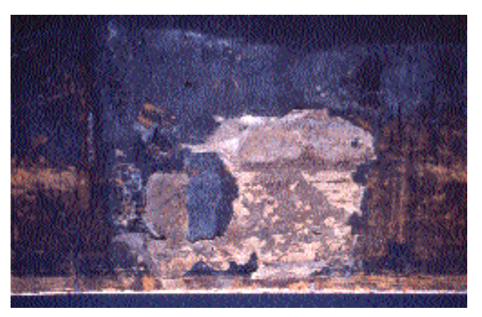
Plate 2 Labels on the reverse of NG 1938

That the picture now in the National Gallery ( Pl. 1 ) is Charles I's picture is suggested by the description in his inventory of the 'reddish ground all crack't' which fits the National Gallery painting and none of the other extant versions. The National Gallery picture is, like the Prado picture, painted black on the reverse, and fragments of two paper labels remain at the bottom ( Pl. 2 ). One label inscribed in ink, possibly in a 17th-century hand, on which the word [p]'ictur' can be read, lies beneath another label in English in a later hand, possibly 18th century, describing the sitter and his marriage. It evidently gives a potted biography of Dürer's father 'Elder was/his prof/ession/married in Nuron(?)/daughter'. Conceivably the label underneath it is a label matching that on the reverse of the Prado picture. The handwriting may be similar. If the labels were found to be alike, this would provide another, possibly