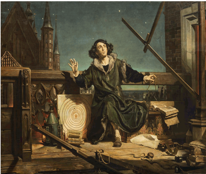
The Jagiellonian University Museum, Krakow