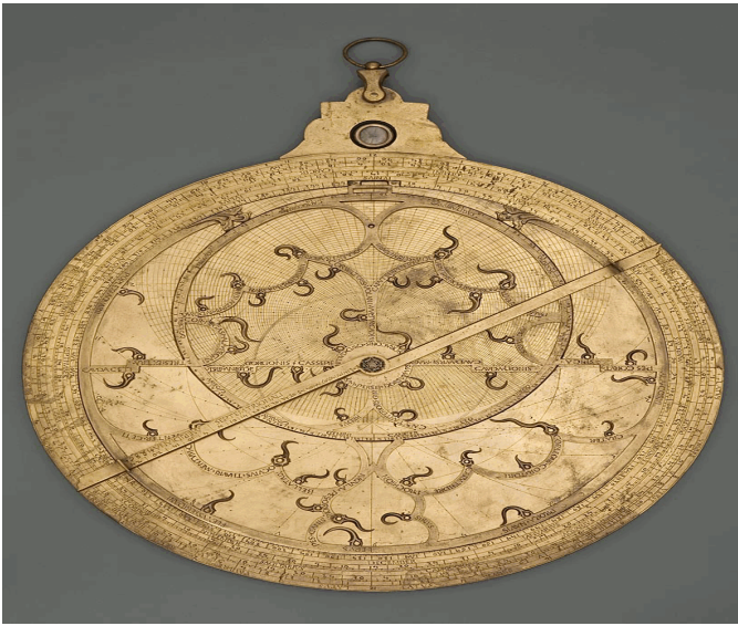
The Jagiellonian University Museum, Krakow