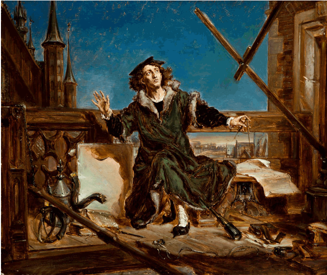
Laboratory Stock National Museum in Kraków