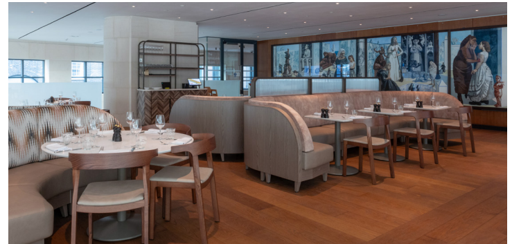
Locatelli Standing 250 · Seated 100