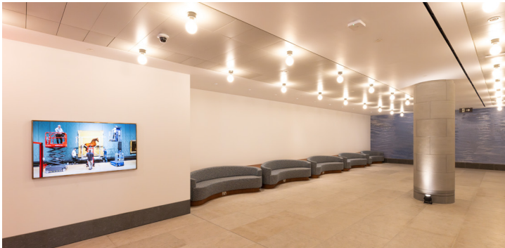
Pigott Theatre Foyer Capacity 250