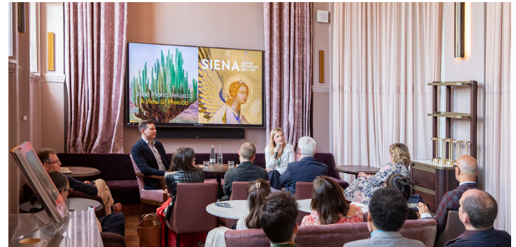
Supporters House Seated 15