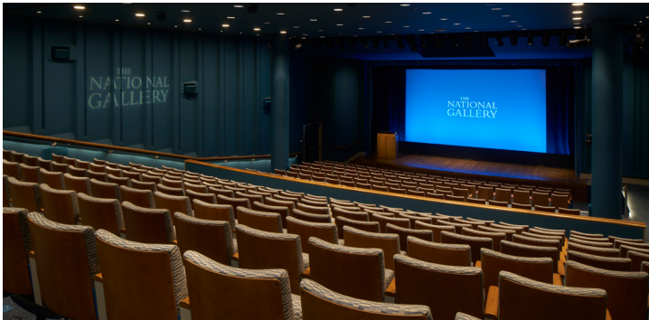
Pigott Theatre Day Delegate Rate Capacity 250