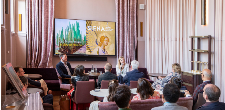
Supporters House Standing 150 · Seated 15 · Private Dining 12