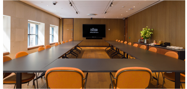
Whitcomb Room Theatre 40 · Boardroom 28 · Cabaret 32