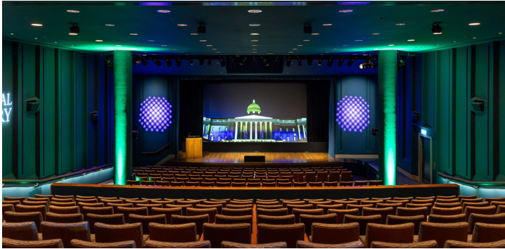
Pigott Theatre Seated 300

Inspire creativity by hosting your conference in one of the greatest galleries in the world.