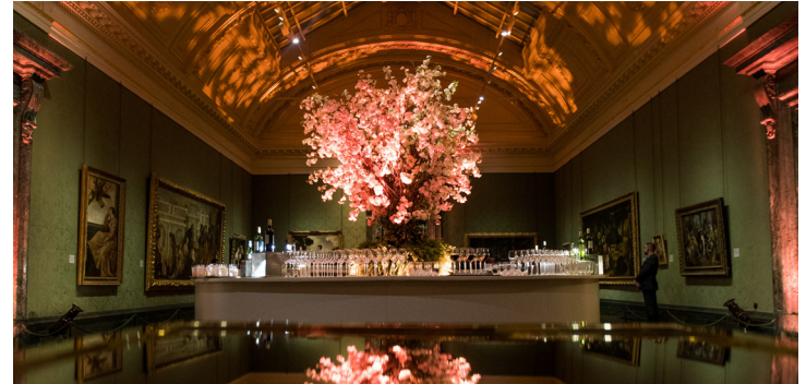
Wohl Room Standing 300 · Seated 250