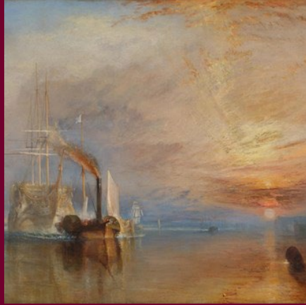
The Fighting Temeraire Joseph Mallord William Turner Room 34