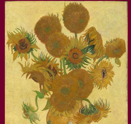
Sunflowers Vincent van Gogh Room 43