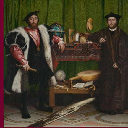
The Ambassadors Hans Holbein the Younger Room 12