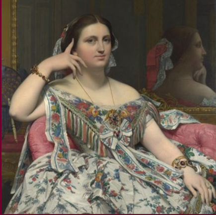
Madame Moitessier Jean-Auguste-Dominique Ingres Room 45