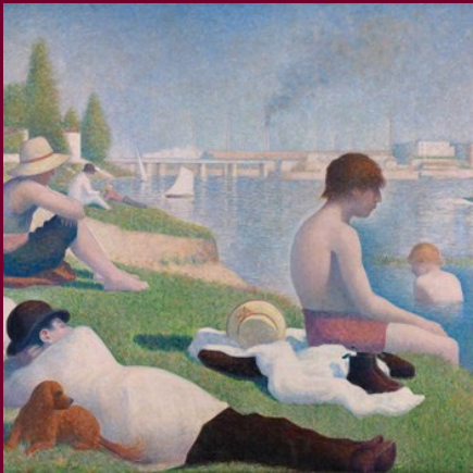
Bathers at Asnières Georges Seurat Room 43