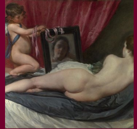
The Toilet of Venus ('The Rokeby Venus') Diego Velázquez Room 30