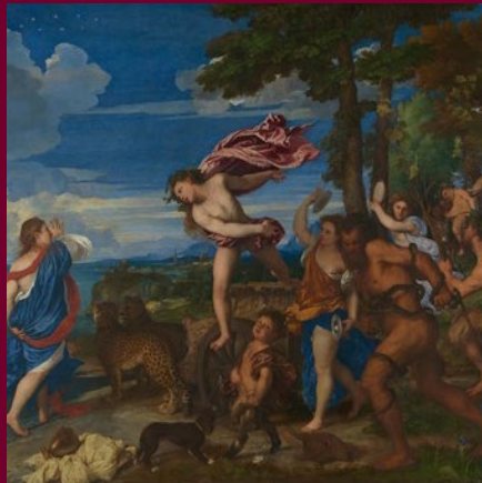
Bacchus and Ariadne Titian Room 10