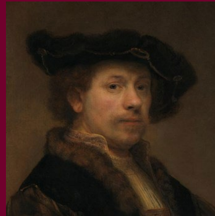
Self Portrait at the Age of 34 Rembrandt Room 22