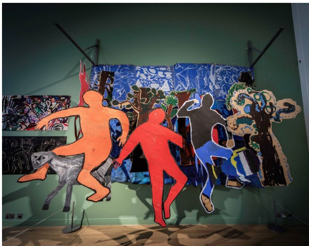
Students' work in response to Poussin Triumph of Pan at York Art Gallery. Masterpiece Tour 2019.

We look forward to receiving your application.