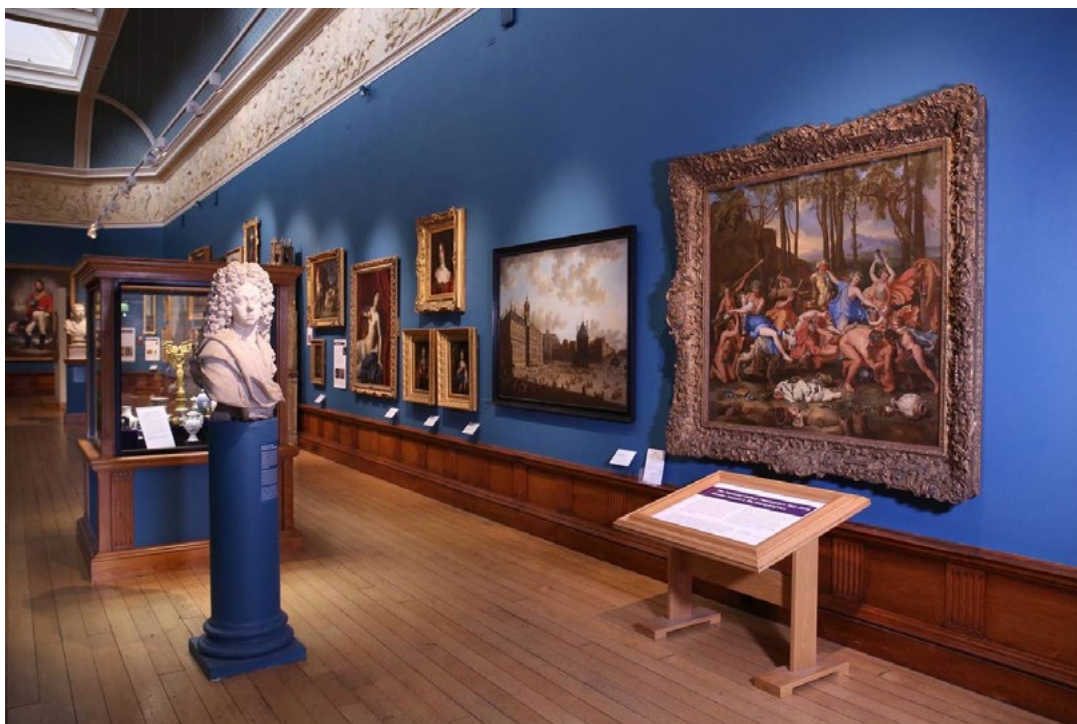
Poussin, The Triumph of Pan on display at Victoria Art Gallery, Bath. Masterpiece Tour 2019.