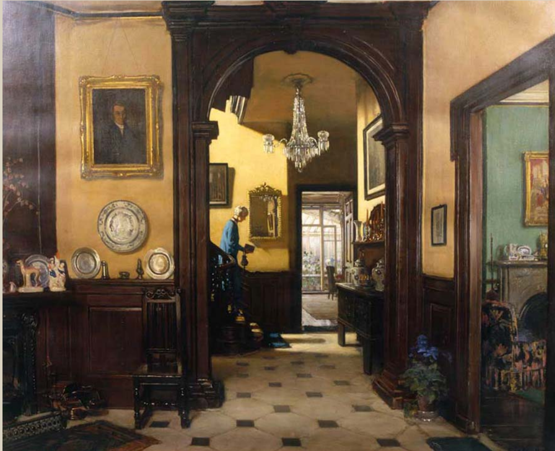
Oil on canvas 100.3 x 125.7 cm Bristol's City Museum & Art Gallery