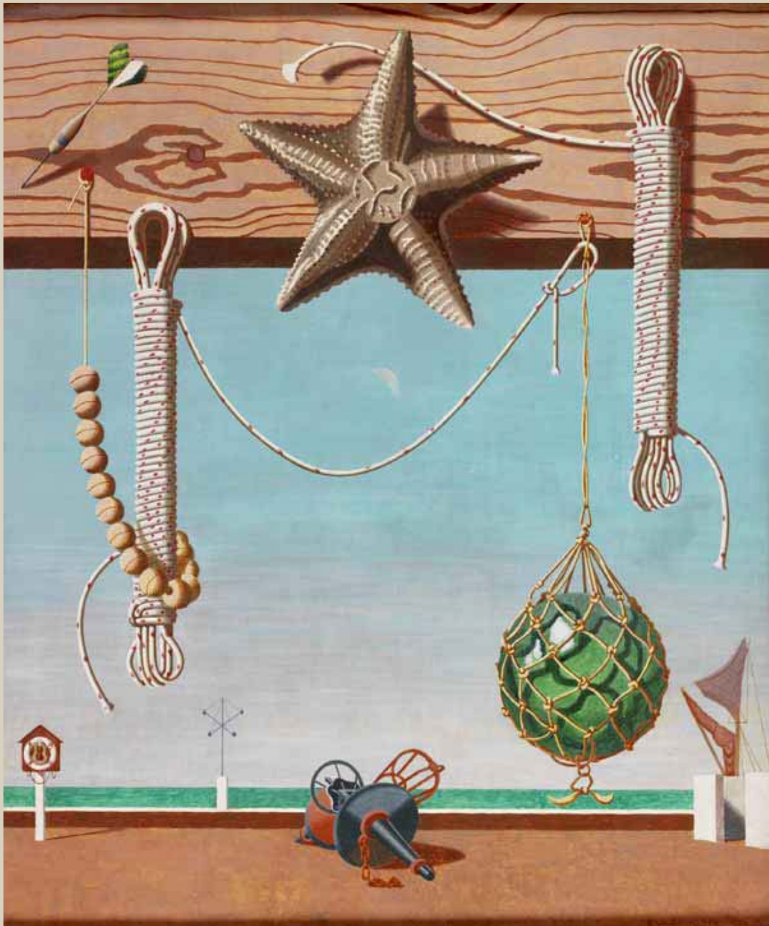
Egg tempera on wood, 76.1 x 63.7 cm Laing Art Gallery, Newcastle upon Tyne