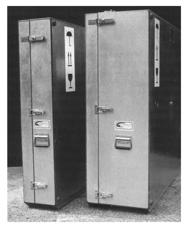
Figure 1 National Gallery Standard (Style 1) case (left) next to a 1987 Lease Standard case ( 1500 \times 1250 \times 430 \text{ mm} ).

Two accelerometers were used to measure the maximum force on impact, one located at the centre of the frame and one at the corner. For the vertical drop tests these were located at the bottom of the frame, and at the top for the topple tests. For the vertical drop on to the standing edge from 60 cm the maximum force experienced was 37 G, recorded at the centre of the frame, and 47.5G when dropped from 90cm. When the case was toppled onto its lid from standing on its base the maximum deceleration experienced was 22.5 G, but