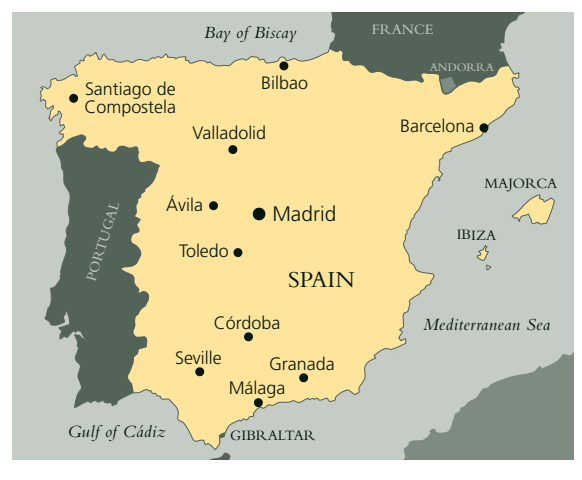
Map of modern Spain