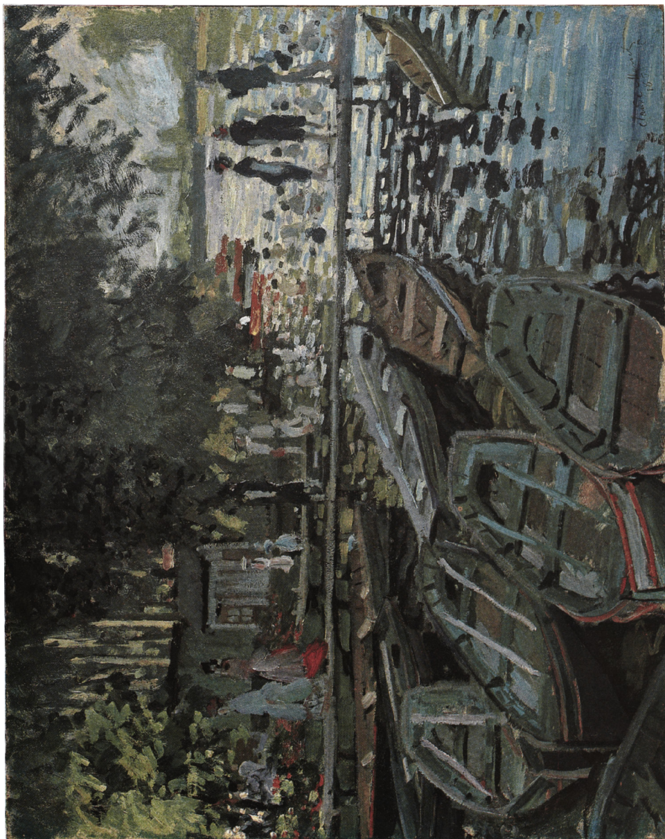
Plate 1 Claude Monet, Bathers at La Grenouillère (No. 6456). After cleaning and restoration.