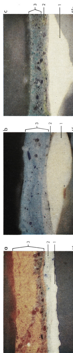
Plate 3 Claude Monet, Bathers at La Grenouillère (No. 6456). Photomicrographs of paint cross-sections. Full caption on facing page.