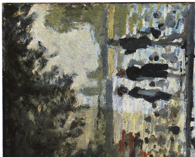
Plate 2a Full caption on facing page.