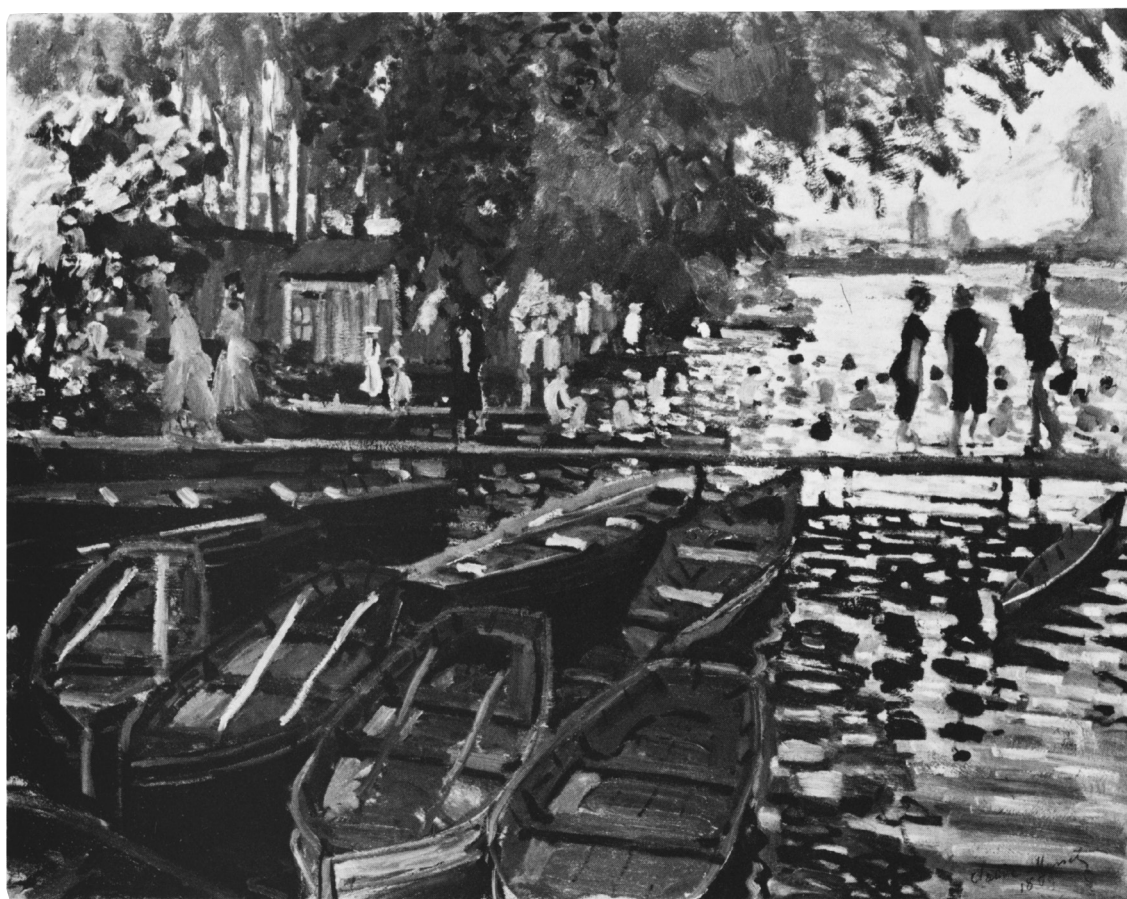
Figure 5 Claude Monet, Bathers at La Grenouillère (No.6456), canvas, 28¾ × 36¼ (73 × 92), signed and dated 1869. After cleaning and restoration.

Removal of the surface dirt and varnish was straightforward except on the area covered by the brownish-yellow glaze. Free of dirt and varnish, the beige sky looked more out of place than before (Plate 2a, p.25 and Fig.6). The reflections of the sky in the river were a cold greenish blue, but the sky remained a warm beige except for a thin streak just above the horizon. The glaze over the trees proved to be more soluble than the varnish, which could not be removed separately from the glaze. At this point paint samples were taken by Ashok Roy (see the third part of this article on p.22) in order to establish the status of the beige paint and of the glaze. Meanwhile a small area (c. 3 mm. across) of the beige paint was scraped away