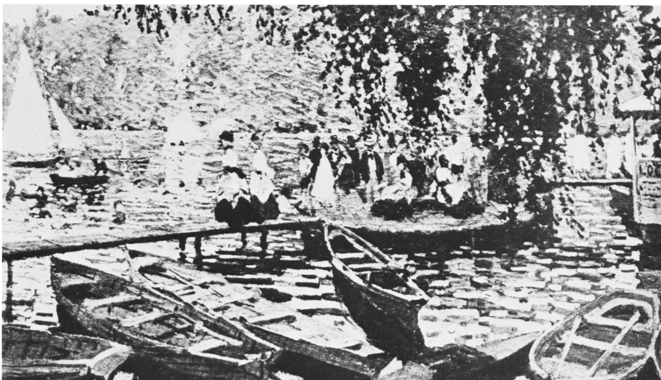
Figure 1 Claude Monet, La Grenouillère , present whereabouts unknown.