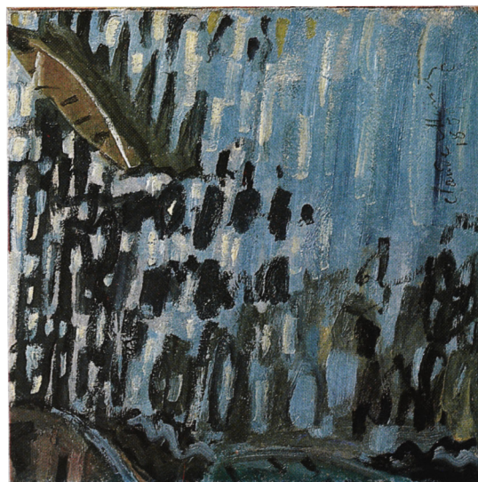
Plate 2b Full caption on facing page.