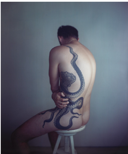
Richard Learoyd (Born 1966)

In reaction to the proliferation of photographic nudes, the Obscene Publications Act of 1857 ruled that intentionally obscene printed matter was liable to destruction. Despite the threat of punishment, business boomed. Today these works are part of the art market, fetching high prices as examples of antique work.