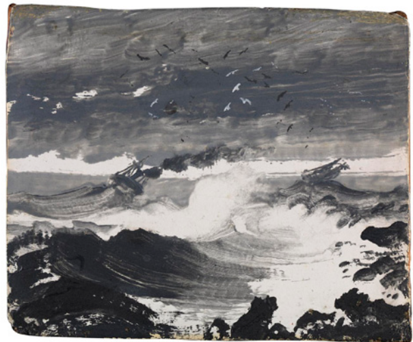
Peder Balke (1804–1887) The Tempest, about 1862 Oil on wood Presented by Danny and Gry Katz, 2010

Although Gray captures transitory effects, his process was anything but instantaneous. The comparatively slow shutter speeds available to him at the time made it impossible to create this scene in one shot. Instead, he innovatively combined three: he added the clouds from a different negative and the immediate foreground from another.