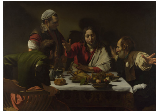
Michelangelo Merisi da Caravaggio (1571–1610)

But flowers wilt and insects die. Likewise our lives are transient and ephemeral. These phases of life are a part of the vanitas tradition, where beauty is but a passing thing and death is always closing in. Vanitas means emptiness in Latin and expresses the transitory and meaningless nature of material existence.