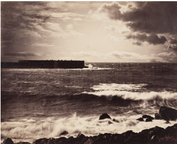
Gustave Le Gray (1820–1884) The Great Wave, Sète (La Grande Vague, Sète), about 1856–59 Gold-toned albumen print

The rise in the importance of landscape painting coincided with the invention of the camera; from the outset photographers were wrestling with many of the same issues as the painters. Both paintings and photographs of landscape in the 19th century reflected a desire to escape the rigours of modern life and the increasingly industrial world.