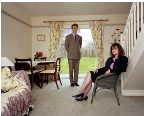
Martin Parr (Born 1952) Signs of the Times, England, 1991