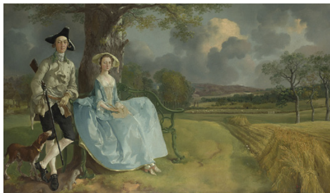
Thomas Gainsborough (1727–1788) Mr and Mrs Andrews, about 1750

Parr was working as a stills photographer on the BBC documentary 'Signs of the Times' (1991) when this photograph was taken. After positioning his sitters, he deliberately delayed the shot in order to capture their growing unease and awkwardness.