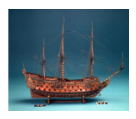
Ship model of a three-decker ship of the line ca. 1675

The UKRG Facilities Report is available on-line at: www.ukrg.org