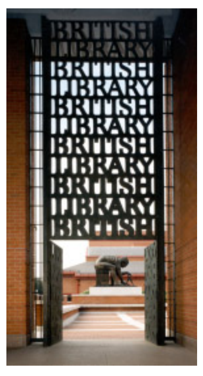
The British Library - Gateway

While one night's stay might generally be sufficient for trips within the UK, if the object needs to acclimatise before installation, the courier may need to stay longer. Overnight stops might not be required at all for short journeys.