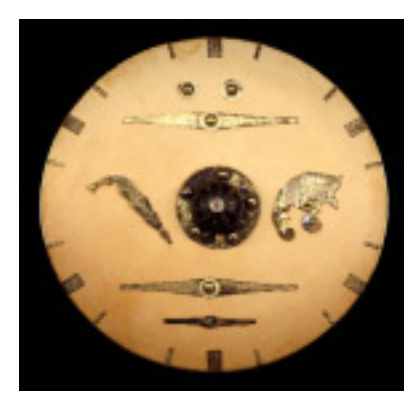
Reconstruction of the shield from the ship-burial at Sutton Hoo. Anglo-Saxon, early 7th century AD, from Mound I, Sutton Hoo, Suffolk, England

Guidelines for couriers have been produced by the UK Registrars Group. These can be found at www.ukrg.org