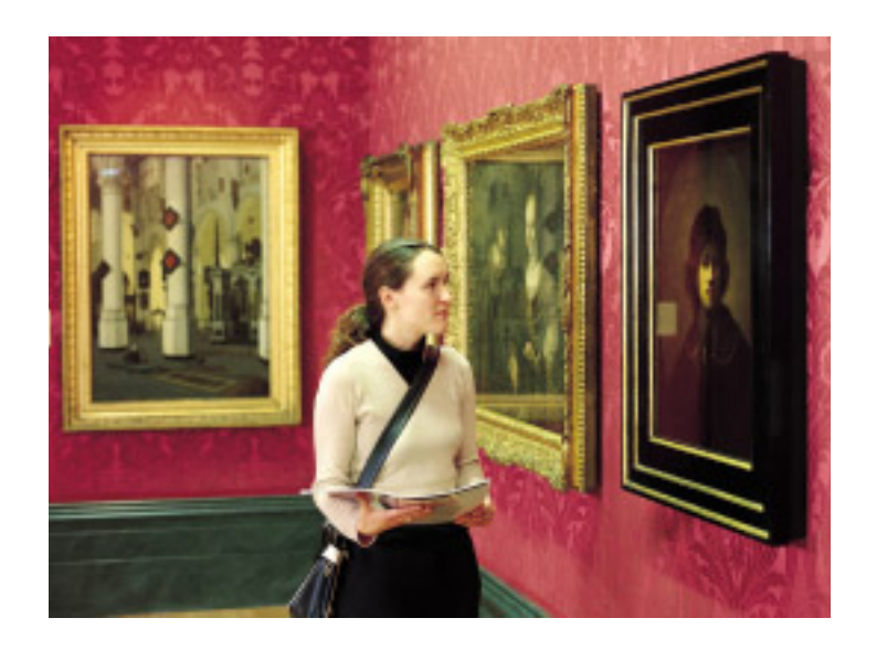
Walker Art Gallery © The Board of Trustees, National Museums Liverpool