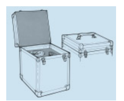
Large hand-carried box

Packing, transport and couriers can add significantly to the cost of loans. The costs will vary greatly depending on the specifications required for care of a particular object. Three-dimensional objects are often more complicated to pack, transport and install than two-dimensional objects. Lender and borrower should try to help each other by reducing costs where possible. Lender and borrower need to be clear about their minimum specifications for packaging, transport and couriers.