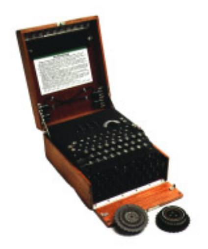
Enigma Machine

Borrowing objects from other collections can be expensive. Although national museums do not charge administration fees for UK loans, the costs of transport, insurance, conservation, security and environmental requirements can be extensive. The cost of the loan can run from zero to several thousands of pounds for a single object. Lenders should, where possible, seek to keep costs to the borrower to a