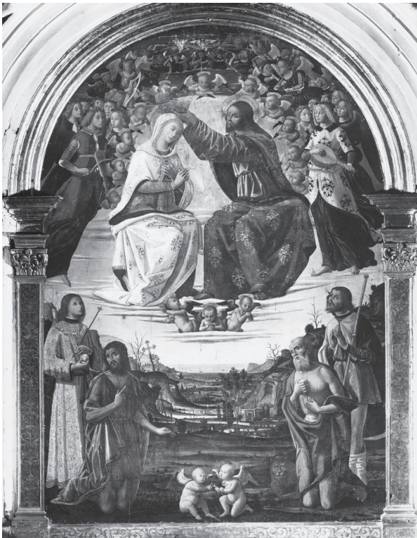
FIG. 1 Bernardino Fungai, The Coronation of the Virgin with Saints Sigismund, John the Baptist, Jerome and Roch , 1506–10. Panel. Siena, Santa Maria di Fontegiusta.

altarpieces is the Coronation of the Virgin , painted for the high altar of Santa Maria dei Servi (PLATE 8), where the main panel remains in situ . In this work, the Virgin's white robe is identical in technique to the London tondo – the palmate pattern set out with conventional sgraffito in the lit areas and with orange-brown paint over grey in the shadows. Some areas of the pattern are divided between light and shadow exactly as in the London panel. The exposed gold is also tooled in the same diagonal manner and direction. 28 As elsewhere in Fungai's work, a variety of other gilding techniques are employed in the Coronation , including the use of draperies patterned with brown mordant touched with gold leaf on the highlighted areas and left ungilded in the shadows, Christ's ultramarine drapery being a case in point.