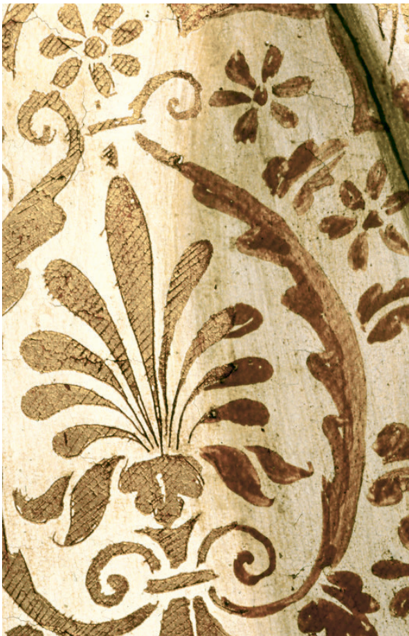
PLATE 4 The Virgin and Child with Cherubim (NG 1331). Close detail of the palmate pattern on the Virgin's drapery.

The reason for this unusual adaptation of traditional sgraffito becomes clear when the surface of the painting is viewed with light striking it at an angle – as possibly was the case in its original setting. When light is reflected from the surface, the areas with bright gold patterning appear to leap forward, while the areas with orange-brown paint recede (PLATES 6A