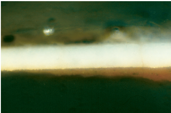
PLATE 3A The Virgin and Child with Cherubim (NG 1331). Paint cross-section of a sgraffito area of the Virgin's white and gold drapery, showing a layer of white paint over gold leaf. An orange-brown layer of bole is present beneath the gold, and gesso below that. Original magnification 220×; actual magnification 170×.