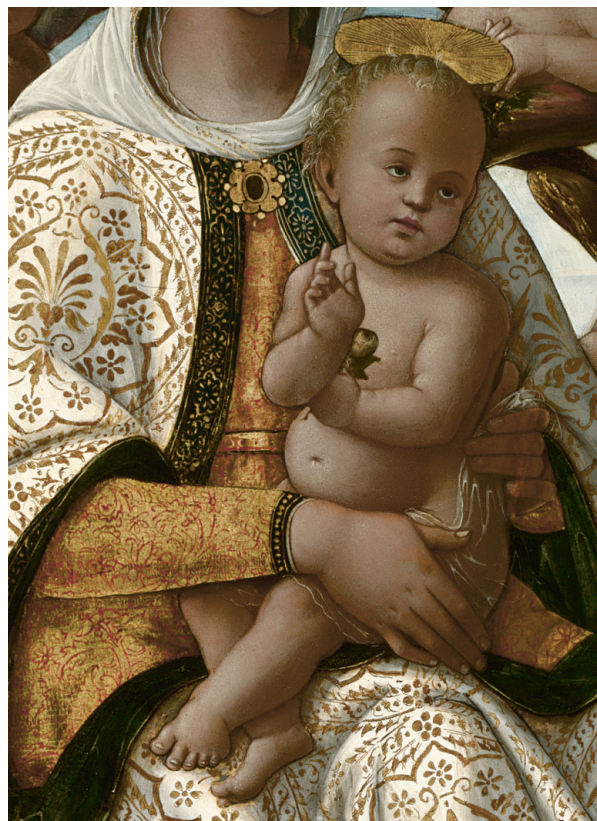
PLATE 9 The Virgin and Child with Cherubim (NG 1331). Detail showing the upper part of the Virgin's inner dress with gilding and red lake design to the left and a painted section, without gilding, in the shadow area.

Water-gilding is used in other contexts. It is employed, for example, for the haloes of the Virgin and the Christ Child in the London tondo, which are depicted as solid golden ovals. Here the gold leaf is heavily inscribed with radial lines, and triangular radiating sectors of the haloes are marked out with translucent red glazes. 34 In the Fontegiusta panel, deep