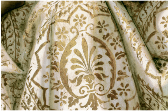
PLATE 2 The Virgin and Child with Cherubim (NG 1331). Detail of the Virgin's sgraffito drapery.