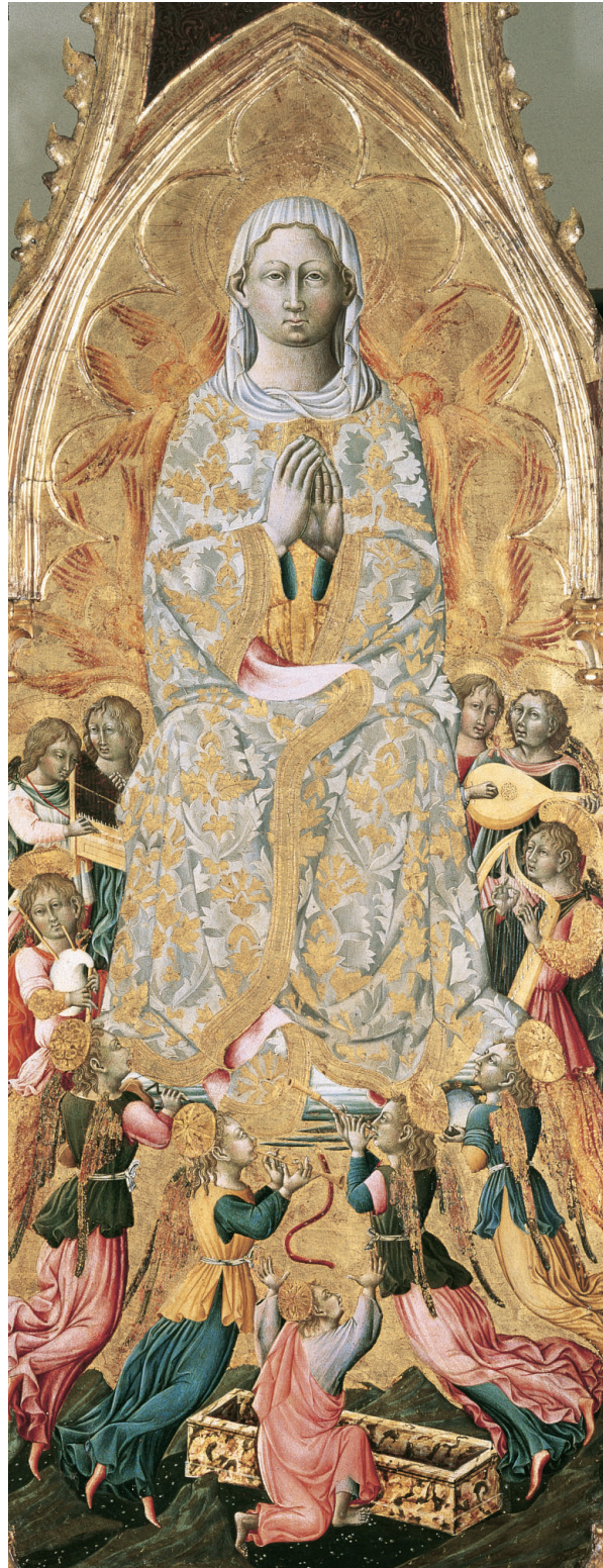
PLATE 7 Giovanni di Paolo, the centre panel from The Assumption of the Virgin and Saints Bernard, John the Baptist, George and Gregory the Great ('La Pala di Staggia'), 1475. Panel, approx. 199 × 210 cm overall. Siena, Pinacoteca Nazionale.

The close resemblance of the key sgraffito passages in the Santa Maria dei Servi Coronation and the London tondo and the general handling of figure shape, flesh tones and so on, suggest that the two paintings may be relatively close in conception and date; the Coronation has traditionally been dated to around 1498–1501. Nevertheless, Pèleo Bacci draws attention to similarities between the white cloths-of-gold in the Coronation and the Virgin and Child Enthroned of 1512 from the Carmine (and, by implica-