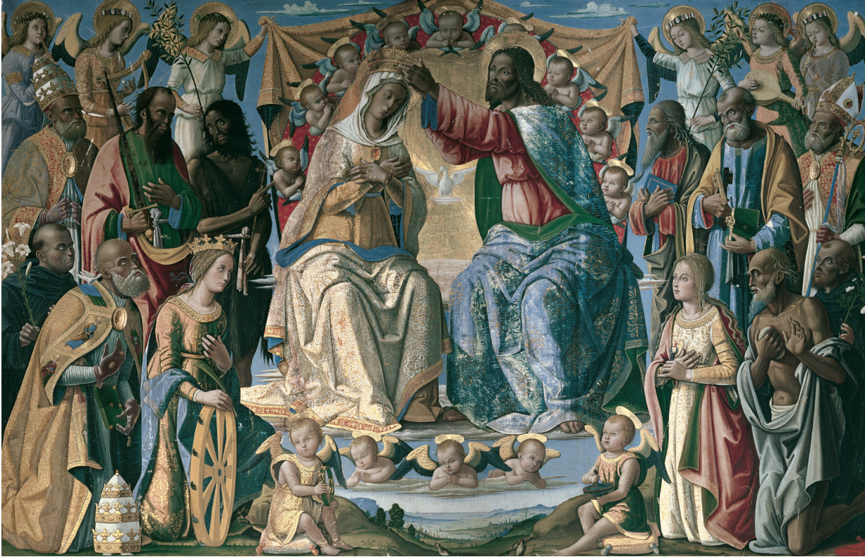
PLATE 8 Bernardino Fungai, The Coronation of the Virgin , 1498–1501. Panel. Siena, Santa Maria dei Servi.

the concept of the sgraffito and paint conjunction of the white and gold mantle (PLATE 9). Closely comparable techniques are found on others of Fungai's works. In the Fontegiusta altarpiece, for example, the Virgin's underdress, parts of the costume of Saint Sigismund to the left and the sleeves of several of the angels in heaven are created using red lake arabesque designs over water-gilding in just the same way as the Virgin's dress in the London tondo. In addition, the hem of Sigismund's drapery continues the gold and red lake pattern onto a band of orange-brown paint with a red lake design, in the same way as shadow areas of the Virgin's dress do in the London picture. In the gilded parts of the latter's drapery, the gold leaf underlies only the highlighted folds of fabric. Equivalent techniques in translucent red, gold and orange-brown for cloth-of-gold draperies occur in both the Coronation of the Virgin in Santa Maria dei Servi and the Carminine Virgin and Child Enthroned in which the technique is used for Saint Nicholas of Bari's robe.