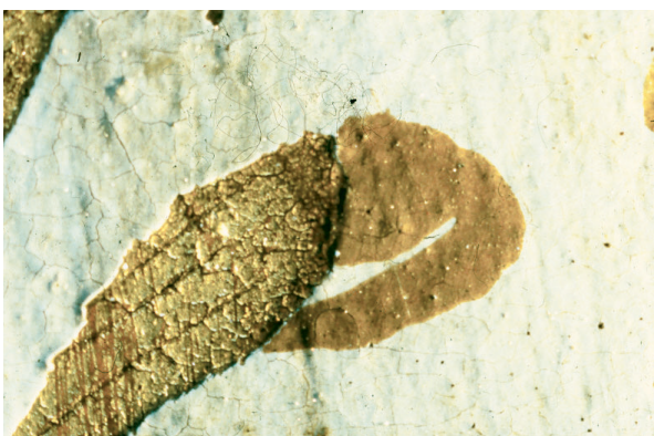
PLATE 5 The Virgin and Child with Cherubim (NG 1331). Macro detail of a single lobe of the palmate pattern on the Virgin's drapery.

and B). The resulting illusion of three-dimensional drapery is highly effective – and this was undoubtedly Fungai's intention. It is significant that one of the few panels by Fungai to remain in situ , the Coronation of the Virgin with Saints Sigismund, John the Baptist, Jerome and Roch (FIG. 1) in the church of Santa Maria di Fontegiusta, Siena, which has a related type of illusionistic gilding (although not identical; see below) is illuminated obliquely through a nearby window early in the morning and through three windows in the opposite wall later in the day (in the absence of any documentary evidence, however, we cannot be absolutely sure that this was its original location). 23