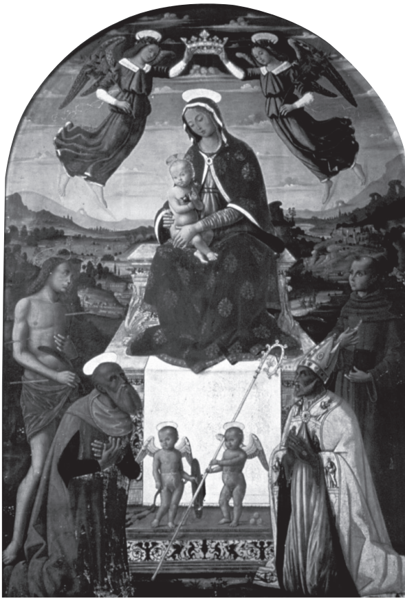
FIG. 2 Bernardino Fungai The Virgin and Child Enthroned with Saints , Carmine Altarpiece, signed and dated 1512. Panel, 315 × 208 cm. Siena, Pinacoteca Nazionale.

tion, the National Gallery tondo), showing that Fungai continued to employ much this technique throughout the latter part of his career. 29 The London tondo has a further connection with the Carmine panel: the throne and the Christ Child in each appear to have been based on the same drawing (reversed for the Carmine painting). A date for the London panel of c.1501–12 would therefore seem the safest conclusion. However, one aspect of the three works changes quite considerably in these eleven years – their landscapes – a feature that may make a more precise dating possible. The Servi Coronation retains a piecemeal landscape constructed with each individual element carefully and crisply isolated within it, notably the fern-like fronds standing for trees, sometimes with little regard for relative scale and often set against what resembles a sequence of theatre flats. This bright, cool style of landscape, inspired to no small degree by Pintoricchio, had been standard for Fungai in the 1490s. It can be observed, for example, in his Saint Clement predella panels, now divided between York and Strasbourg, probably originally part of the