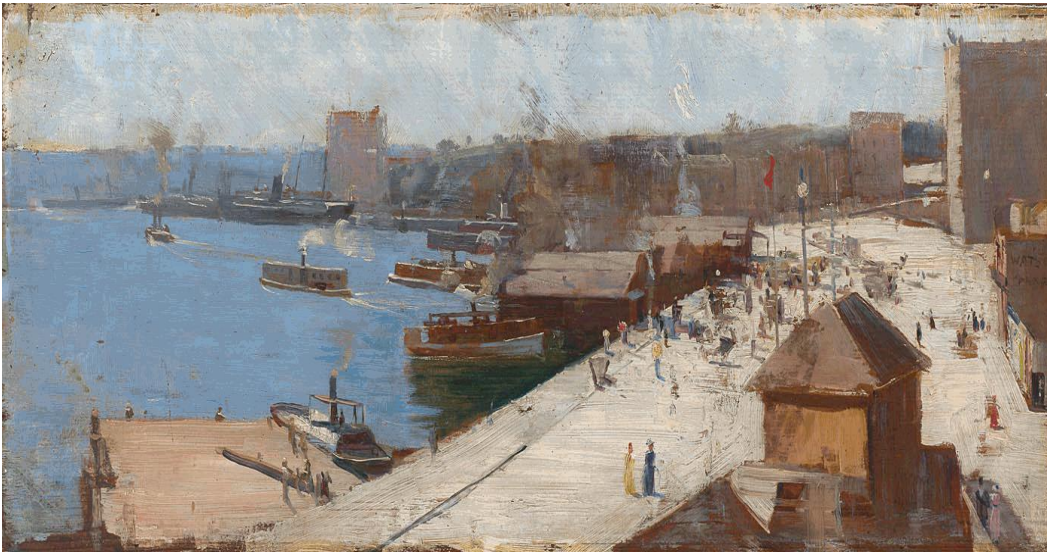
Purchased 1959