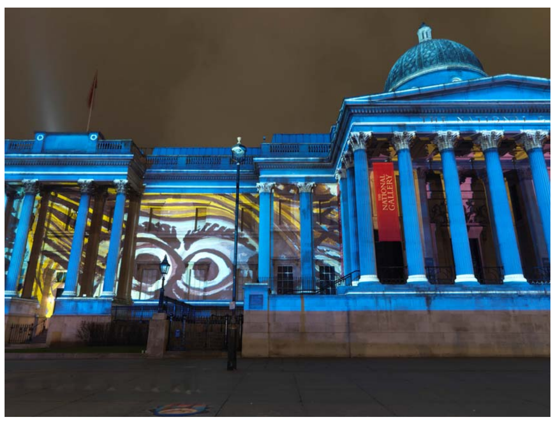
Figure 1 Picasso projection on the Gallery facade

The National Gallery houses one of the finest collections of Western European paintings in the world. It is open to visitors free of charge all year round. The chief priority of the Gallery is to protect the paintings for future generations. Its activities, described in more detail in the sections below (2.2-2.7) are divided between care for the collection, access to the collection, interpretation and study of the collection, enhancement of the collection, and additions to the collection.