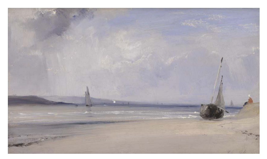
Figure 4 Richard Parkes Bonington's La Ferté On loan to The National Gallery, London

The main loan exhibitions during 2009 will be Picasso: Challenging the Past , an exhibition conceived in partnership with the Musée Picasso and the Réunion des Musées Nationaux, and The Sacred Made Real , an exhibition of Spanish sculpture and painting of the seventeenth century, organised together with the National Gallery of Art, Washington DC.