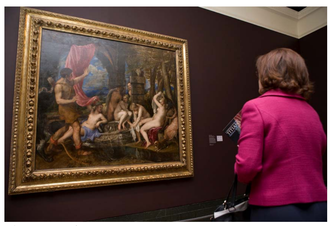
Figure 5 Campaign for the Titians: Titian's Diana and Actaeon on display in Room 1

While starting to plan for the future acquisition of Diana and Callisto the Gallery will also continue to try to attract future gifts and legacies of paintings. Loans also represent important additions to the collection. A newly attributed portrait by Pontormo has been added to the display. Titian's Portrait of a Young Man has returned on loan.