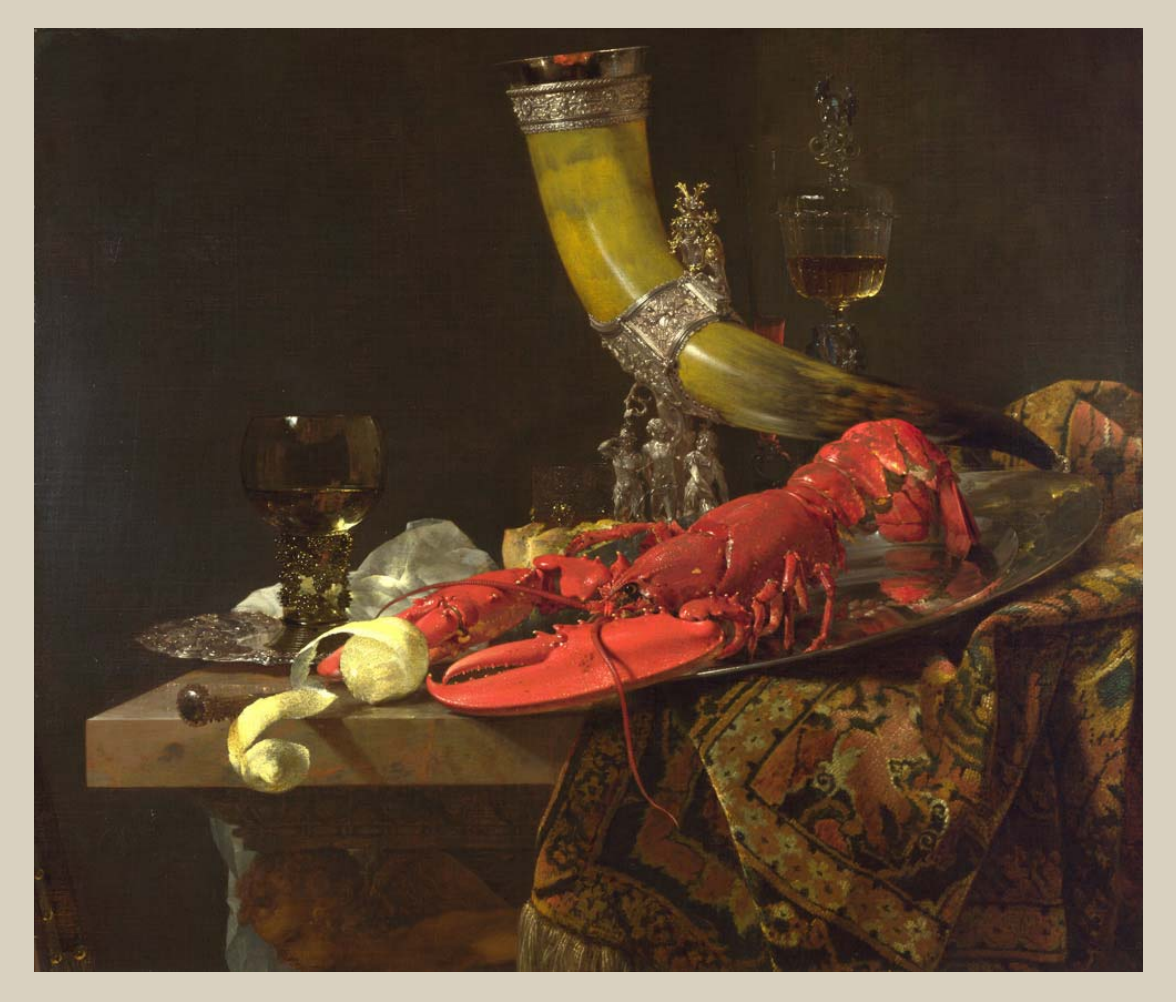
Oil on canvas 86.4 x 102.2 cm